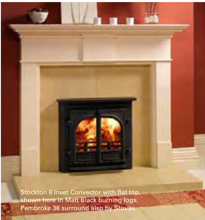
Stockton 8 Inset Convector with flat top, shown here in Matt Black burning logs. Pembroke 36 surround also by Stovax.