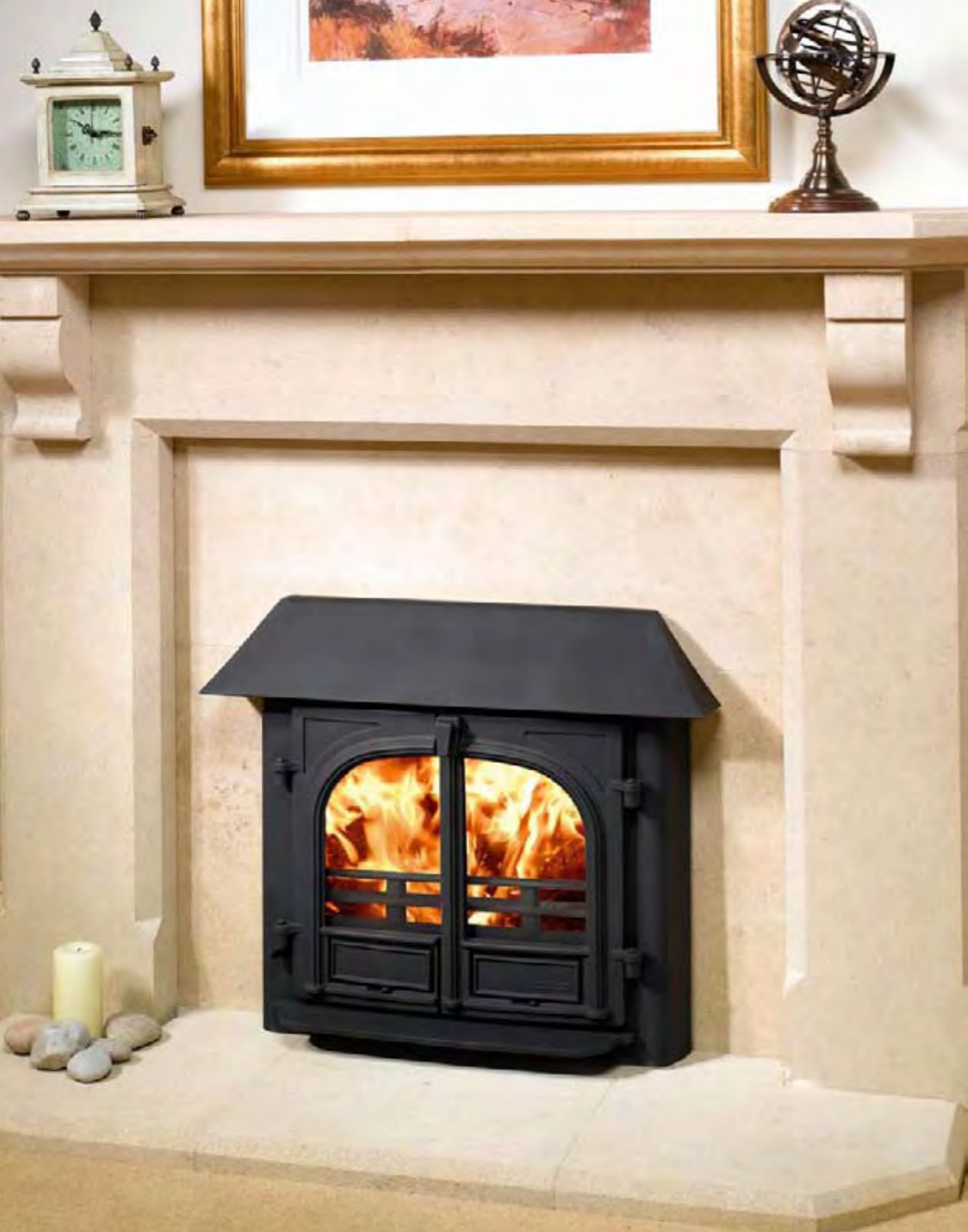
Stockton 8 Inset Convector with canopy top, shown here in Matt Black burning logs.